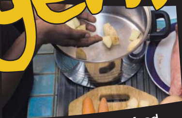
before touching food